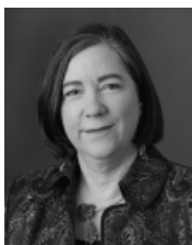
SUSAN L. LINDQUIST, Ph.D., Member and Former Director, Whitehead Institute for Biomedical Research; Professor of Biology, Massachusetts Institute of Technology