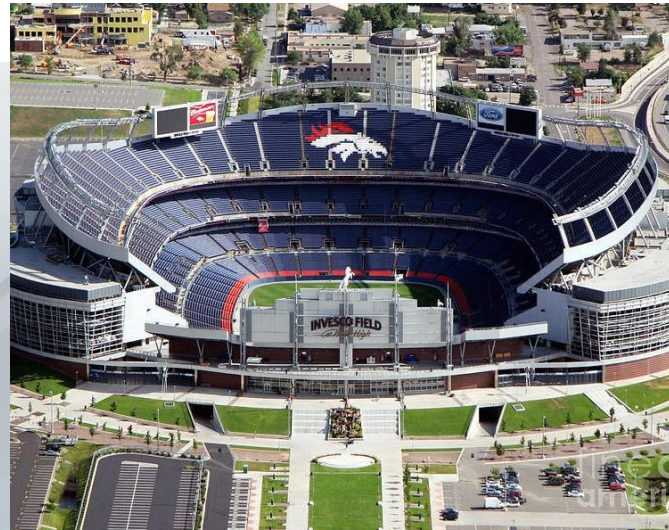
Mile High Stadium