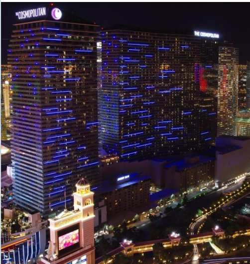
The Cosmopolitan of Las Vegas